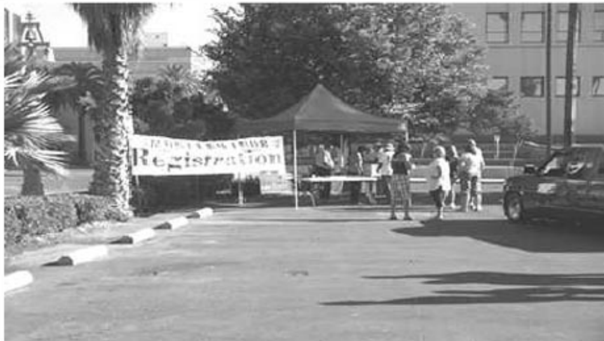
>>> On-Site Registration begins...

Old Farts Racing Team Newsletter Jan/Feb/Mar 2008 Issue Old Farts Racing Team P.O. Box 56041 Riverside, CA 92507 Published Quarterly